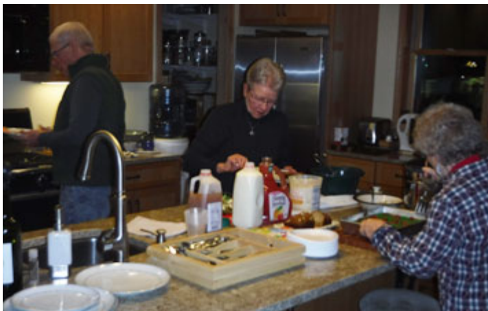
Two Pats and a Mary enjoying a pre-COVID CBC potluck.....to hold you over for next year's!

To see a map of the La Crosse Count Circle to see if you live in the circle and can do a feeder count, click on this link: http://www.couleeaudubon.org/pdf/cbc/cbcmmap_lacrosse.pdf .